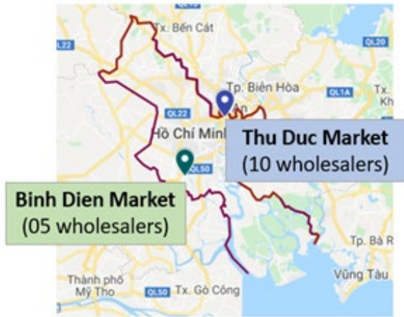
Figure 3. Thu Duc market and Binh Dien wholesale market, Southern Vietnam