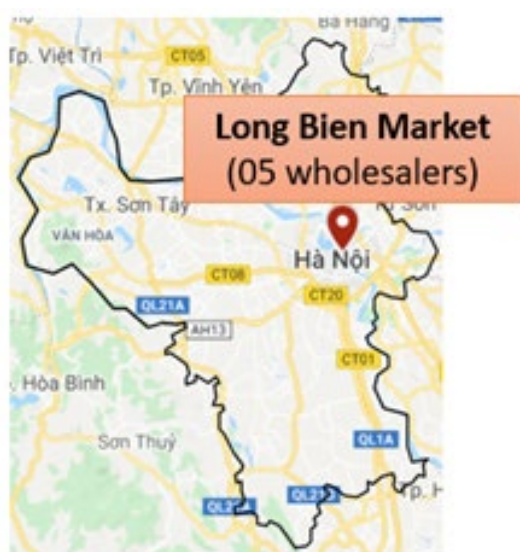
Figure 2. Long Bien wholesale market, Hanoi