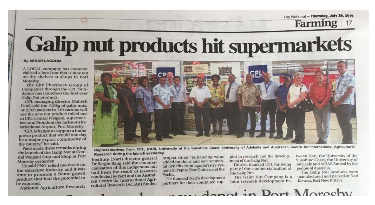
Figure 3: Product launch in CPL Waigani supermarkets and Prouds at the international airport.

The Galip Nut Company hoped to be 'nationally owned' in the future (EMTV) <a href="https://youtu.be/K4U9uMJpmKQ">https://youtu.be/K4U9uMJpmKQ</a> Products from Galip Nut Company officially launched and showcased (EMTV) <a href="https://youtu.be/M11D3mDOvXw">https://youtu.be/M11D3mDOvXw</a> PNG's first home grown nut brand, Galip Nut available on shelved for sale (EMTV) <a href="https://youtu.be/ji3ijbShutc">https://youtu.be/ji3ijbShutc</a> Allan backs potential of Galip (Post Courier) <a href="https://postcourier.com.pg/allan-backs-potential-galip/">https://postcourier.com.pg/allan-backs-potential-galip/</a>