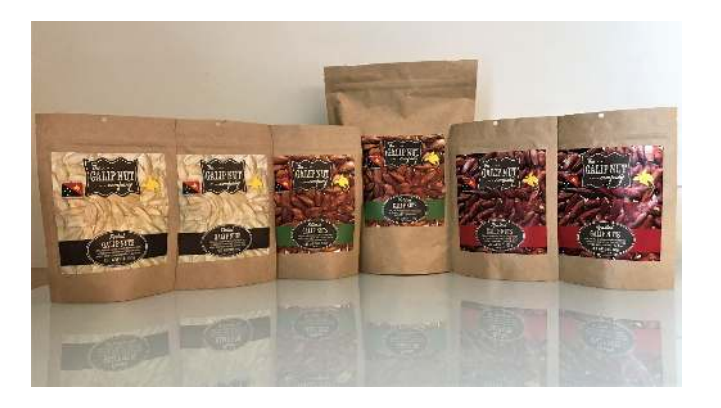
Figure 1: Final packaging formats for 100g, 60g and 1kg.