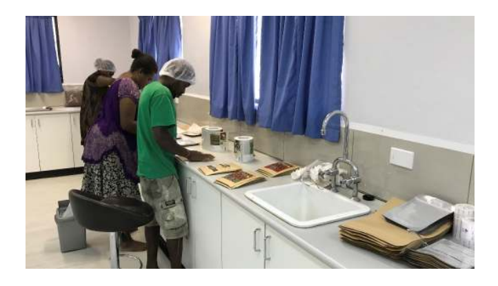
Figure 2: Training of packaging procedure ahead of the launch. Image credit: Theo Simos

Figure 1: Final packaging formats for 100g, 60g and 1kg. Image credit: Theo Simos