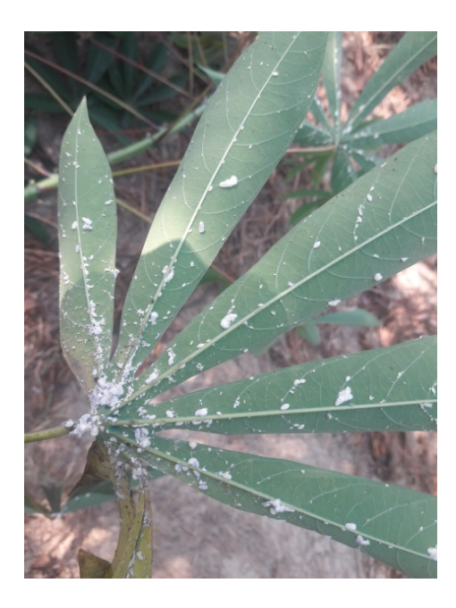
Figure 17: Nymphs and eggs of mealybug found on cassava in Hinthada Township

in attacking the Phenacoccus manihoti mealybug. The parasitoid however has not been seen in the Ayeyarwady region.