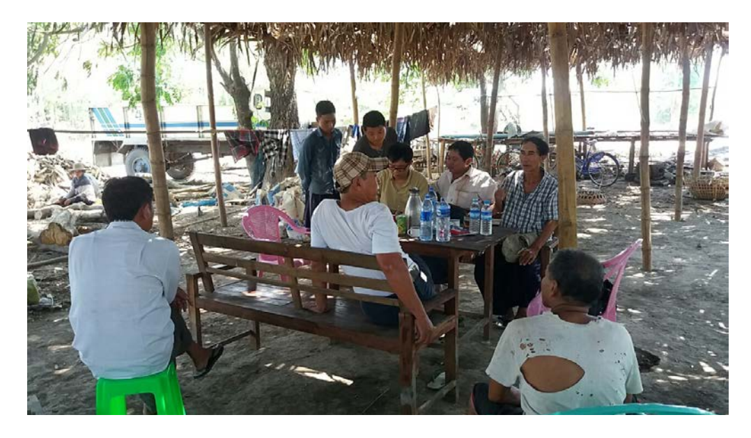
Figure 6: Discussions being held with farmers and local processors on cassava demonstration trials.