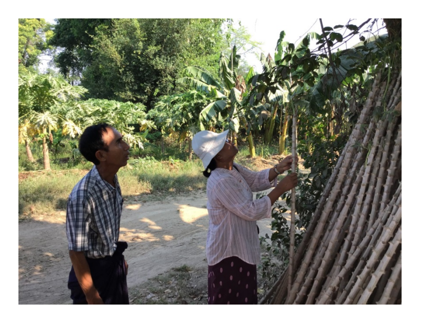
Figure 15: Monitoring of emerging insects and diseases on cassava by DOA officers in Hinthada township

The Hinthada DOA cassava team have been monitoring the emergence of cassava pests and diseases in Ayeyarwady region and their incidence appear to be on the rise, which calls for more research and appropriate control strategies (Figure 15). The most important pests found in Ayeyarwady region include whiteflies, mealybugs, red mites, scale insects, and termites. Cassava bacterial blight (CBB), witches' broom disease, and root rot disease are also major diseases, all of which can cause tremendous damage on cassava production. Fortunately the cassava virus disease has yet to be found in the Ayeyarwady region. Regardless, with higher incidence of pests and diseases, special care must be taken when transporting planting materials between regions as well as among farms.