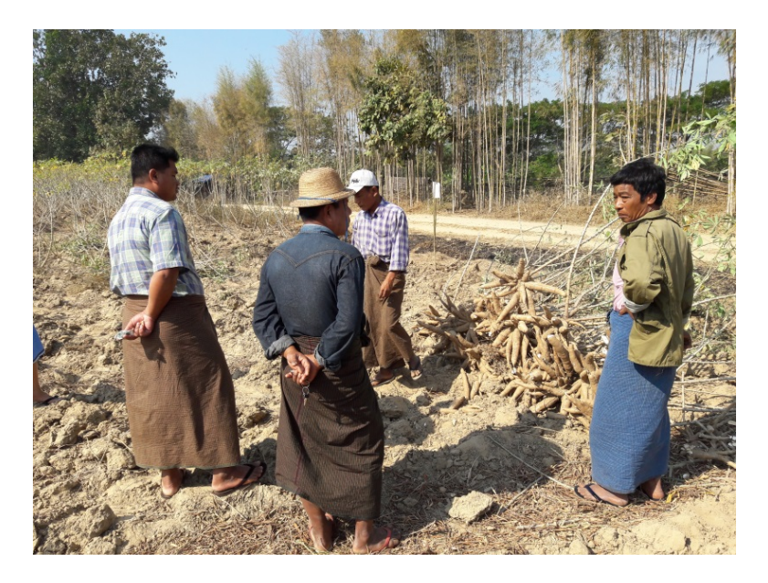
Figure 13: Evaluation of cassava demonstration trials by local farmers and processors

There was high enthusiasm from the participating farmers as well as members of the cassava grower, miller and trader association in learning about the demonstration trials and their results. The DOA extension workers, local farmers, and processors were all actively involved in jointly evaluating the results of the cassava demonstration trials (Figure 13 and Figure 14). In addition to farmers, the field days also provided a valuable experience to the DOA extension officers to be educated in identification of cassava varieties, optimal planting methods, fertiliser responses, as well as methods used for measuring root yields and starch content after harvesting.