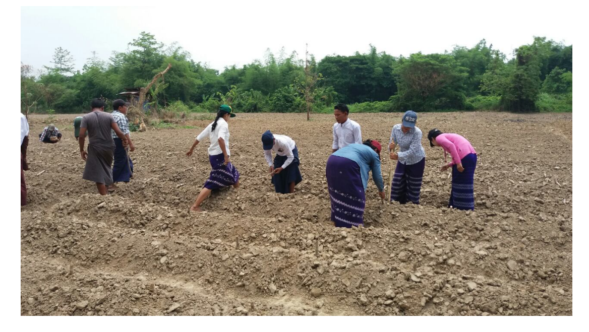
Figure 5: Practical session at the cassava field during ToT training

There was active participation from the participants during both the classroom and field training sessions. The sessions were regarded as being very informative and enabled participants to set up on-farm demonstration trials. In addition they have also been involved in sharing their technical knowledge and experiences with other farmers in neighbouring villages.