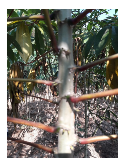
Figure 18: Cassava Bacterial Blight found in Lemyethna Township