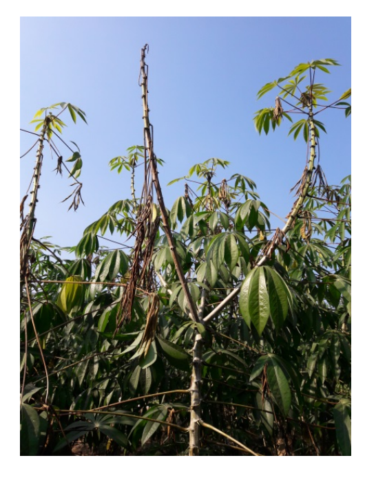
Figure 19: Die-back of cassava due to Cassava Bacterial Blight disease in Kyonpyaw Township