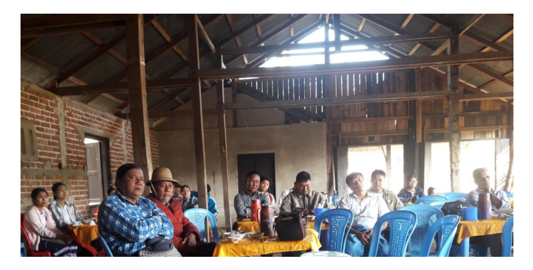
Figure 12: Farmers, processors, and DOA officials attending the field day in Hinthada district

There was high enthusiasm from the participating farmers as well as members of the cassava grower, miller and trader association in learning about the demonstration trials and their results. The DOA extension workers, local farmers, and processors were all actively involved in jointly evaluating the results of the cassava demonstration trials (Figure 13 and Figure 14). In addition to farmers, the field days also provided a valuable experience to the DOA extension officers to be educated in identification of cassava varieties, optimal planting methods, fertiliser responses, as well as methods used for measuring root yields and starch content after harvesting.