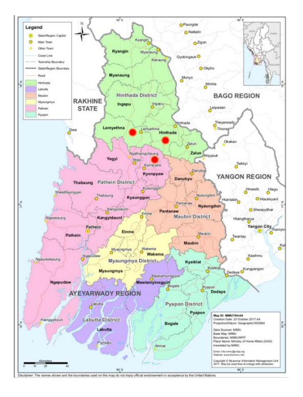
Figure 1: Location of townships selected for research activities in the Ayeyarwady region

After consultations with regional Department of Agriculture (DOA) officers and village leaders in both districts, three townships were selected for the research activities. The selected townships were Hinthada and Lemyethna townships in Hinthada district and Kyonpyaw township in Pathein district (Figure 1).