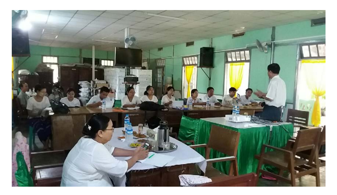
Figure 4: Classroom session at DOA Hinthada Office