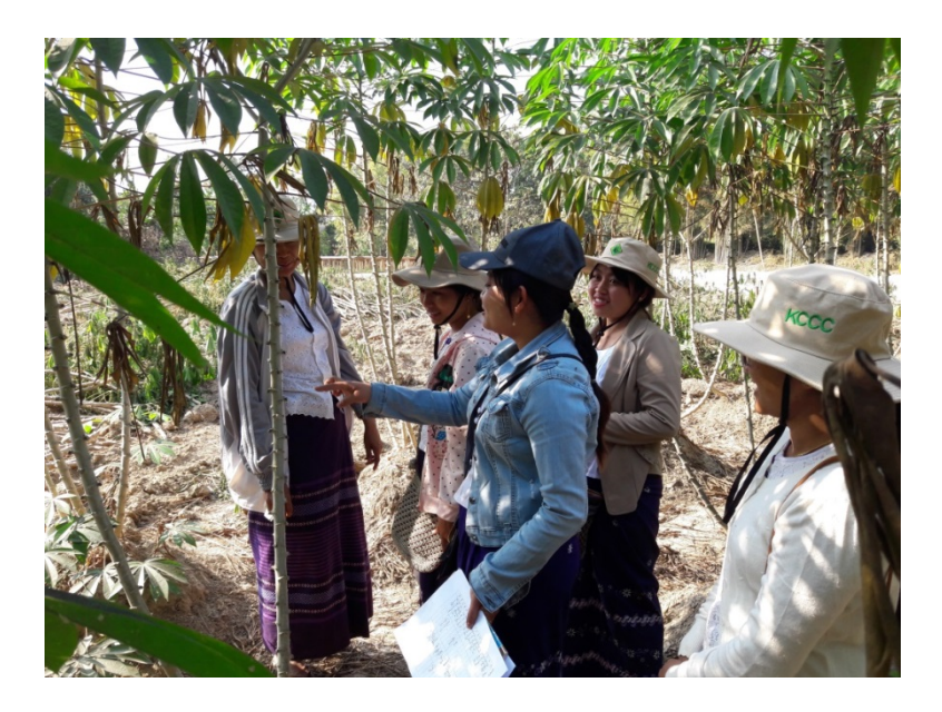
Figure 14: Evaluation of cassava demonstration trials by DOA extension workers in Hinthada township

One of the key benefits of the field day was the opportunity it provided participants representing different stakeholder groups to share their own experiences and discuss the situation of cassava cultivation and processing in the Ayeyarwaddy region. While enabling the participants to understand general problems across the different sectors of the industry chain, it also allowed them to realise potential areas for improvement. Most farmers during the field day appeared to understand that their cassava productivity had been significantly lower than its potential as a result of reduced access to optimal varieties, agro-inputs, and information on crop management techniques.