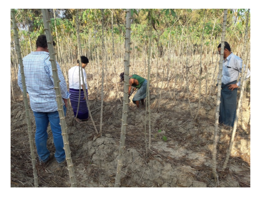
Figure 11: On-farm multiplication of Rayong 9 in Laymyethna Township

Since 2010, high-yielding cassava varieties have been introduced and tested on farmer fields in Ayeyarwady. Farmers as a result appear to be quite aware of the higher yields and starch content of industrial varieties such as Rayong 9, KU50, and Rayong 72 compared to local varieties. KU50 and Rayong 9 are better for starch processing due to their high HCN content in their roots. However, Rayong 72 can be used both for starch processing as well as for direct human consumption and feeding animals. On-farm multiplication of planting materials of high yielding cassava varieties including Rayong 9, KM 98-1, KU50, and Rayong 72 were demonstrated in the 2019 growing season (Figure 11). The names of farmers who participated in the demonstrations along with their respective locations (village names) are presented in Appendix C.