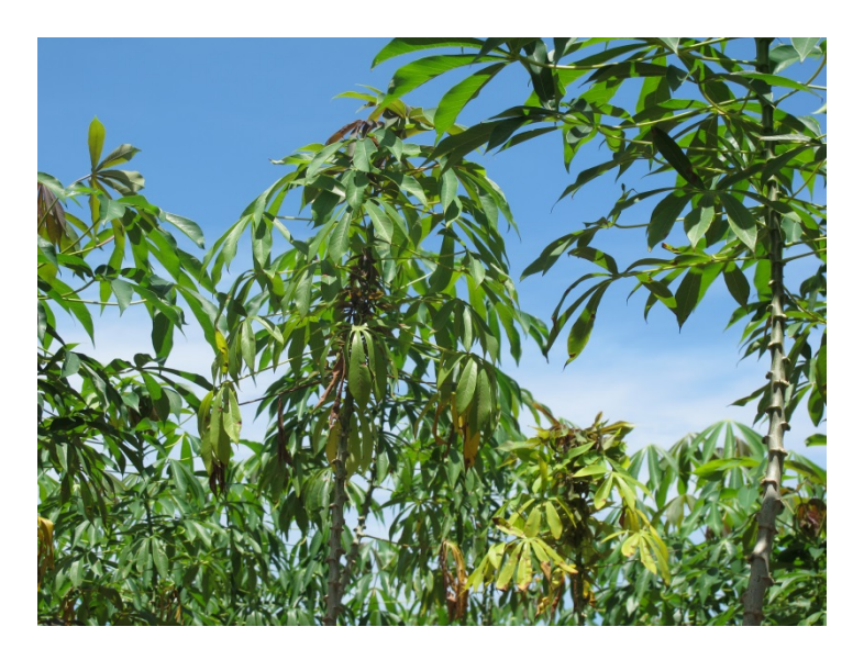
Figure 20: Cassava Witches' Broom Disease found in Kyonpyaw Township

Recently, symptoms of the new Witches' Broom disease have been observed in cassava plants in the Ayeyarwady region, especially in Kyonpyaw and Laymyetna Townships. Cassava plants reveal excessive sprouting of small leaves with short petioles (Figure 20). In general, plants are dwarfed and show an exaggerated proliferation of buds, as well as shoots and small branches growing from a single stake. Sprouts have short internodes and many small leaves. If plants are infected early in the growth cycle, they remain stunted. This disease is mainly transmitted through the use of stakes cut from infected plants. To prevent the disease from spreading, the recommended control measures are not available for farmers in Myanmar.