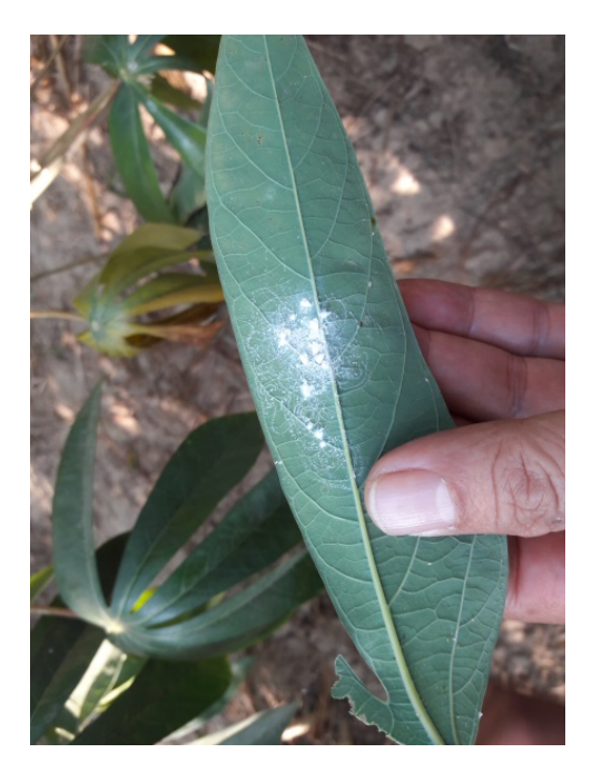
Figure 16: Spiraling whitefly found on cassava in Hinthada Township

Whiteflies are considered to be one of the most damaging insects to the cassava plant. In addition to feeding on the plant they also transmit viruses. The whitefly species, Aleurodicus disperses , or spiraling whitefly, is currently found in the Ayeyarwady region (Figure 16), where it can cause serious feeding damage and possible cassava yield losses. Another whitefly species, Bemisia tabaci , the vector of several serious virus diseases in Africa and other parts of South and Southeast Asia, has not yet been found in Myanmar. The control of high populations of whiteflies involves spraying insecticides, although some consider these measures to be ineffective as the whitefly species can double their population in only 4.2 days. Proper control methods are not available for cassava farmers in Myanmar.