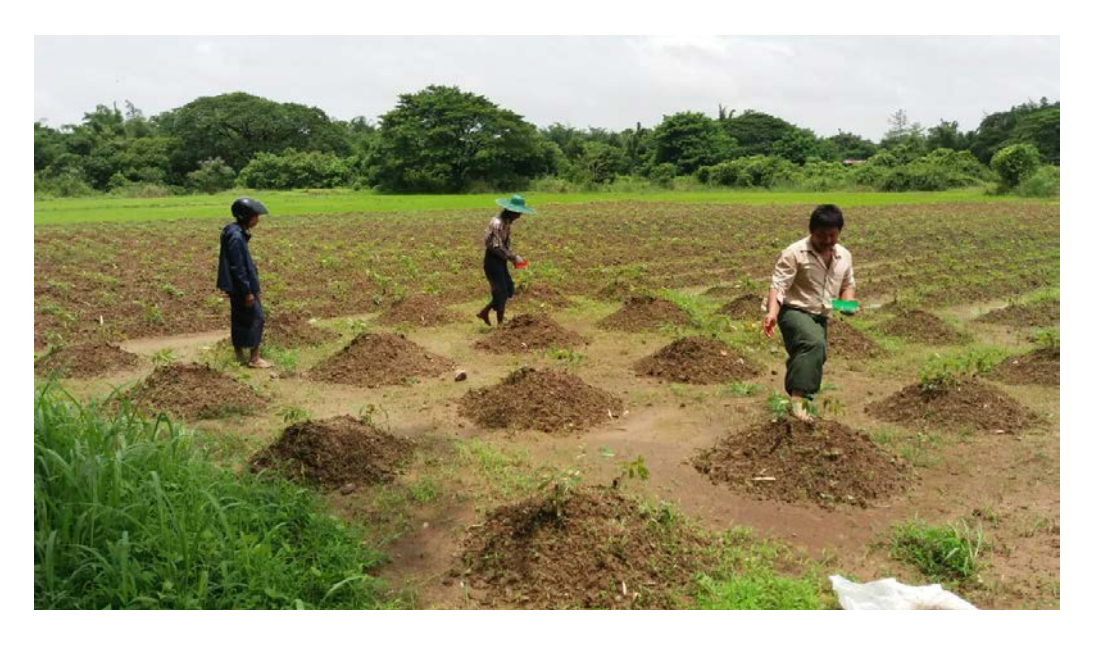
Figure 10: Planting method demonstration trials in Kyonpyaw Township

The demonstrations on farmer fields in Hinthada and Kyonpyaw townships involved the mount and ridge methods (Figure 10). The name of farmers participating in these demonstrations and their respective locations are presented in Appendix B.