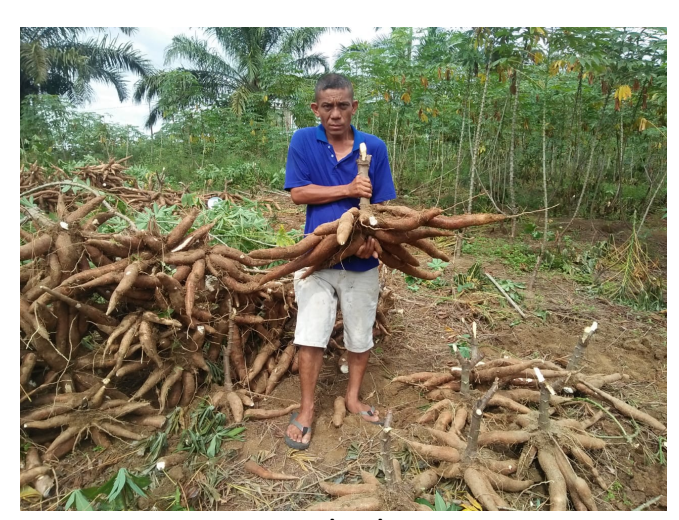
Agents take best varieties