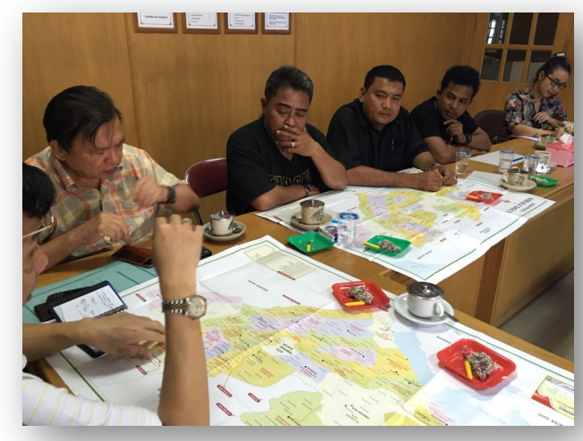
Planning with factory staff