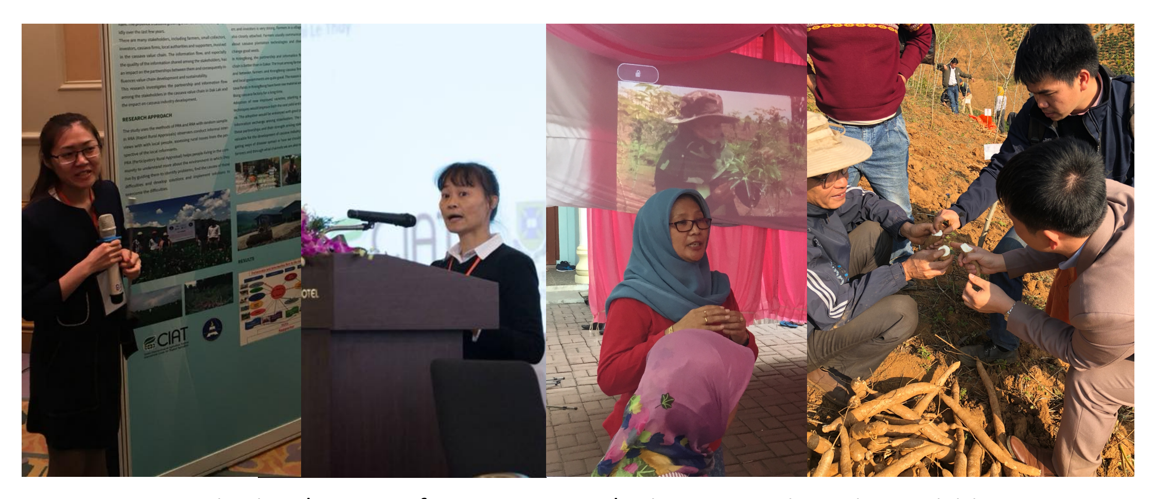
Active involvement of government and private sector in project activities Project results presented at conferences, symposia, workshops and training activities Facebook Group