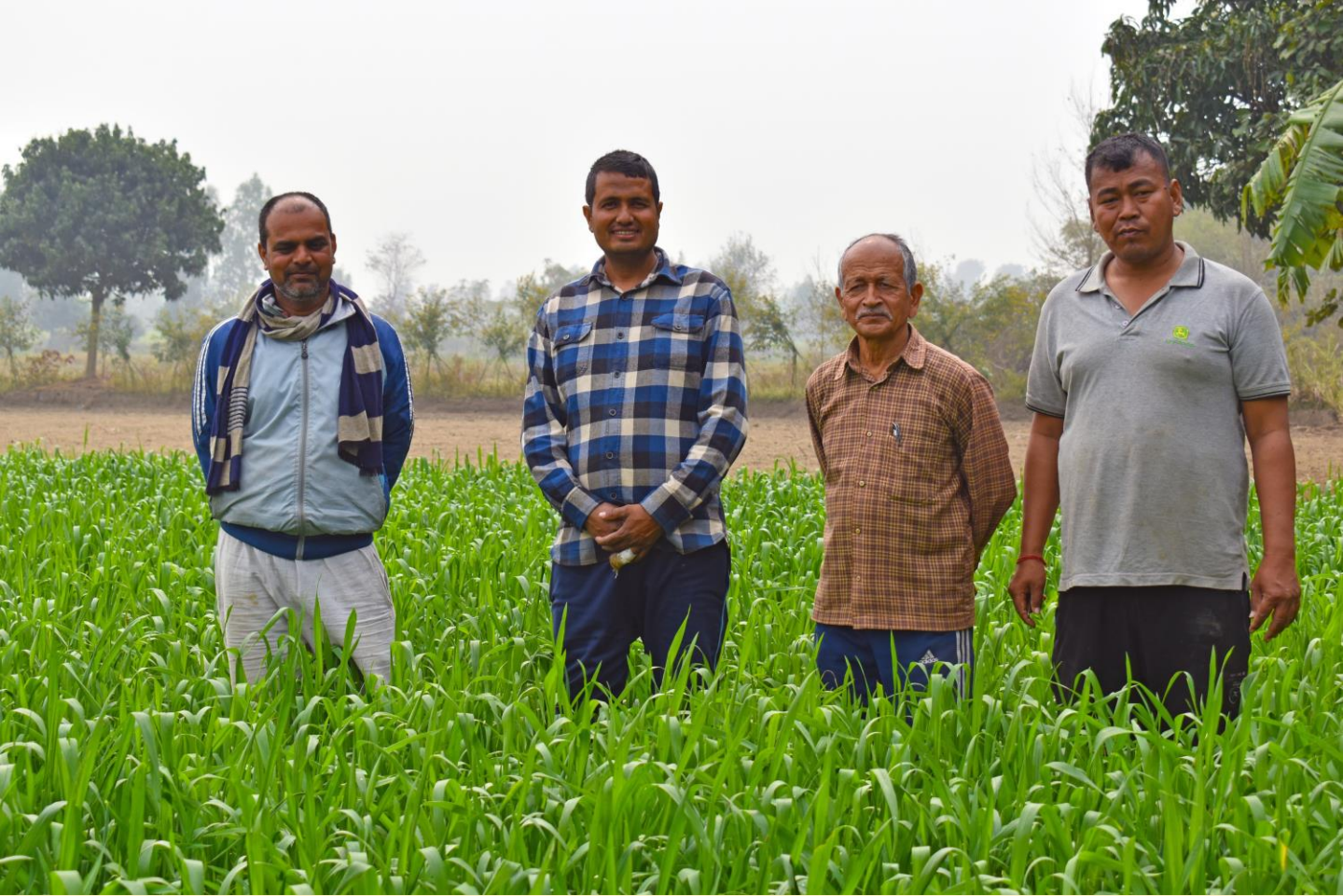
Visiting progressive farmers from Namobuddha Cooperative at Bateshwar Village, Province 2