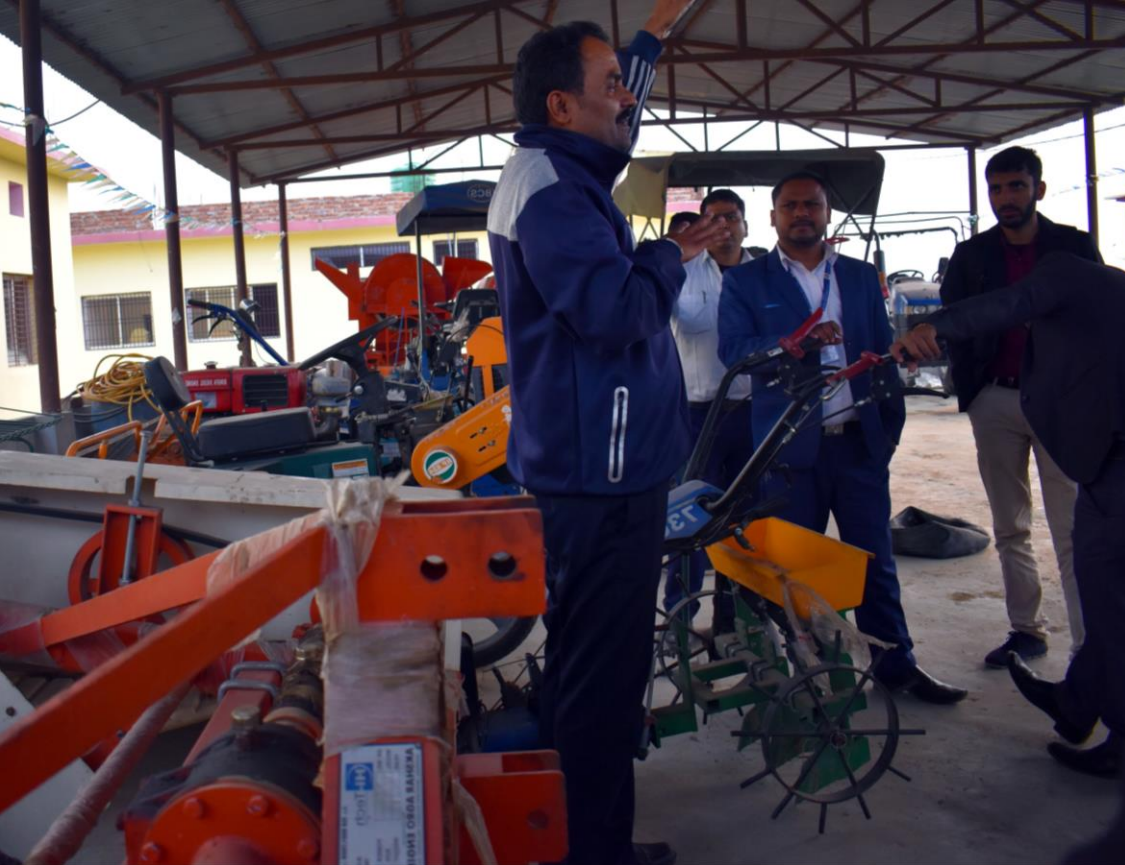
Field trip with Province 2 to Agricultural Machinery Testing and Research Center at Nawalpur