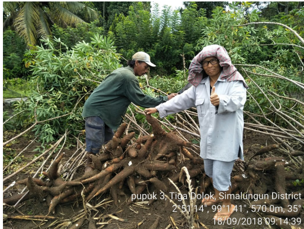
Demonstration with traders