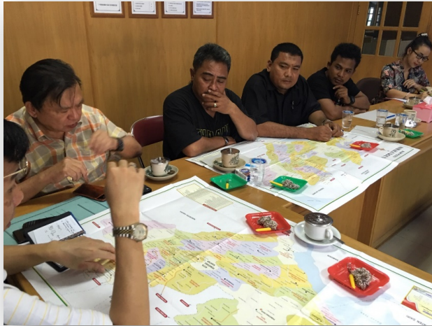
Planning with factory staff