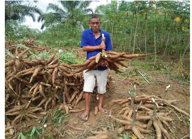
Agents take best varieties