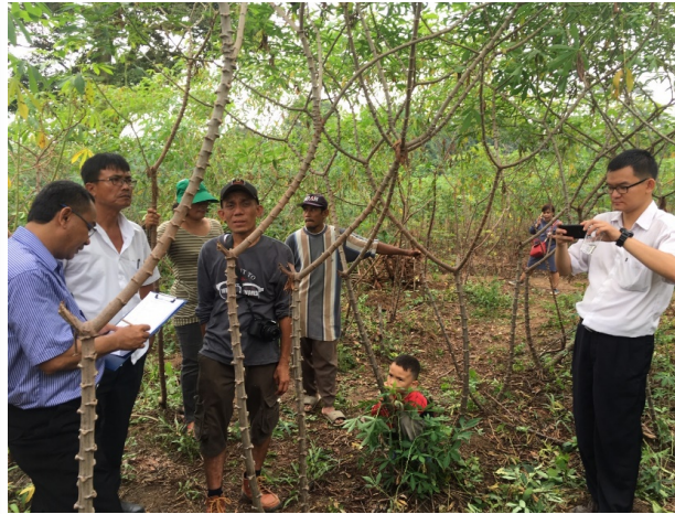
Trials on factory land