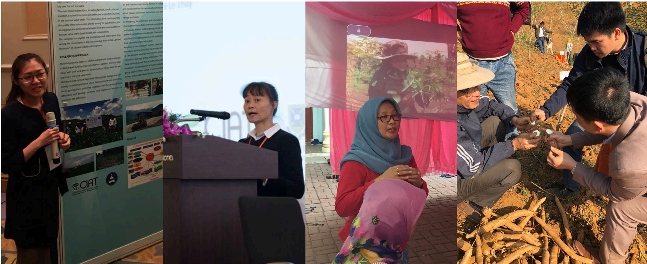
Active involvement of government and private sector in project activities Project results presented at conferences, symposia, workshops and training activities Facebook Group