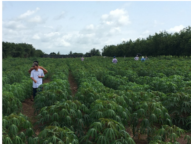
Demonstration with farmer leaders