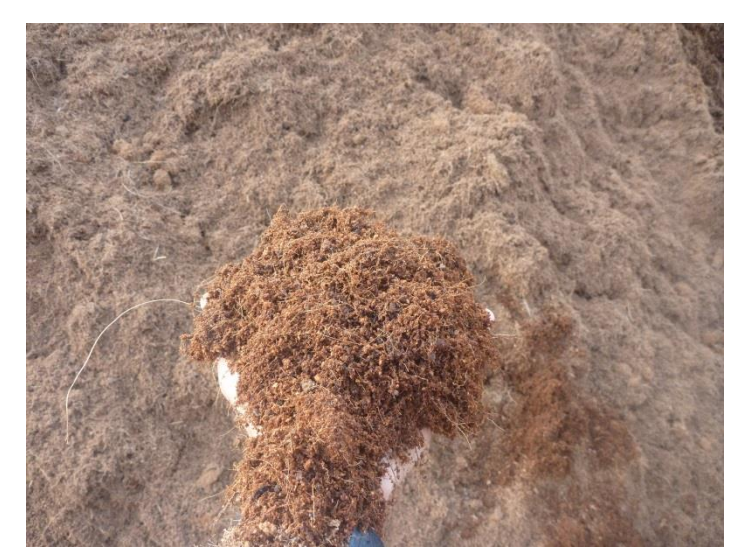
Potting media preparation