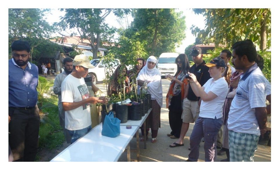
Budding at Thanathon