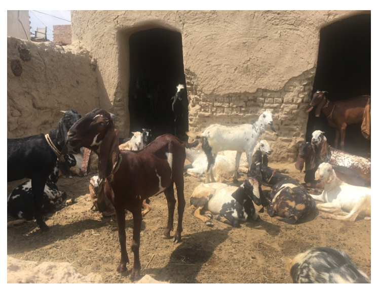
Fig 3: Goats at a mixed livestock farm; 51_3R, Okara (resource rank: rich)