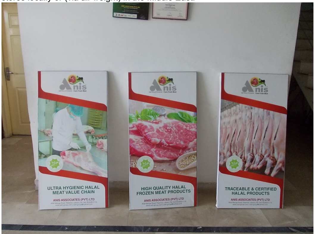
Advertising material for Foodex International – supplier to value chains 2 & 3 ('New domestic' and 'Export')

Value chains 2 and 3 have stronger vertical integration, with large traders often using employees or contractors to source animals from farms, rather than from a series of livestock markets. These value chains have a deliberate emphasis on this oversight along the supply chain. There was a clear increasing demand for modern retail butchers selling chilled, high-quality and safe meat cuts for the income elastic groups of middle and upper class consumers, opening new opportunities for smallholders. Export markets were largely aimed at Pakistani expatriates in the Middle East. There is clear demand for Pakistani mutton, particularly as export markets in the Middle East are driven by factors like competitiveness, consumer preferences, and religious and cultural familiarity (Aw-Hassan et al., 2008). As described above, animals for both value chains 2 and 3 are sourced from the same trading networks in Pakistan as for domestic consumption, then slaughtered in high-quality private facilities and supplied through a well-maintained cold chain to retail stores locally or (via air-freight) in the Middle East.