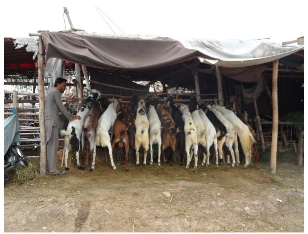
Animals for sale for religious sacrifice (Sittqa) - Lahore municipal livestock market, Punjab province

All of our SRA findings indicate small stock owners use their stock as an ATM, selling them on an 'as needs' basis to manage their cash flow. This automatically restricts what value chains farmers can sell into. If selling on a needs-basis, they cannot select the price they receive, or the time they sell. Those families that particularly depend on small ruminants for cash flow are those that also live in the resource poor regions, as they have limited to no alternative income from other agricultural products (like milk). Increasing the quantity and quality of goats and/or sheep would potentially give them more flexibility to pursue alternative markets and hold onto some stock so they can meet the more lucrative target markets.