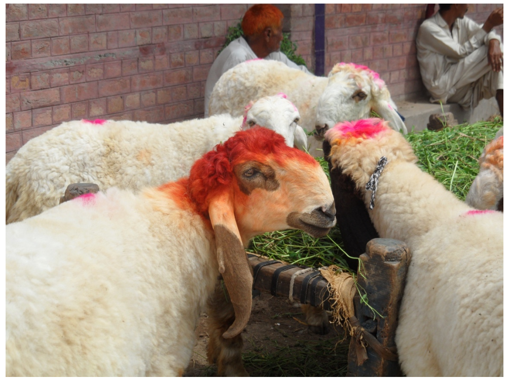
Sheep for sale for Eid-al-Azha in Lahore municipal livestock market, Punjab province

The religious sacrifice value chain is a very important separate activity for the small stock market. Very high prices can be obtained at this time of year, but according to our farmer participatory activities, these were rarely targeted. This is likely because there is an outlay of resources to invest in the animals and supplementary feed, which requires access to finance. There is also a greater risk when targeting the Eid-al-Adha market if the tighter market specifications are not met, and so even if producers had access to finance, they may not capitalise on this market option. Those farming families that did, managed to do so very successfully, but there was only a handful of examples of this. When we did encounter them, they were also mixed livestock farmers that lived in resource rich regions.