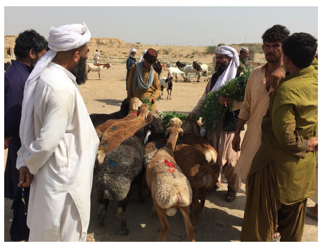
Ethnic Afghans trading fat-tailed sheep in a local market outside Karachi, Sindh province

Trading networks appear to operate efficiently over wider geographic areas, with traders and their employees sourcing animals from a variety of areas according to price and availability, and potentially transporting live animals over long distances, and through one or more livestock transactions, to supply large population centres.