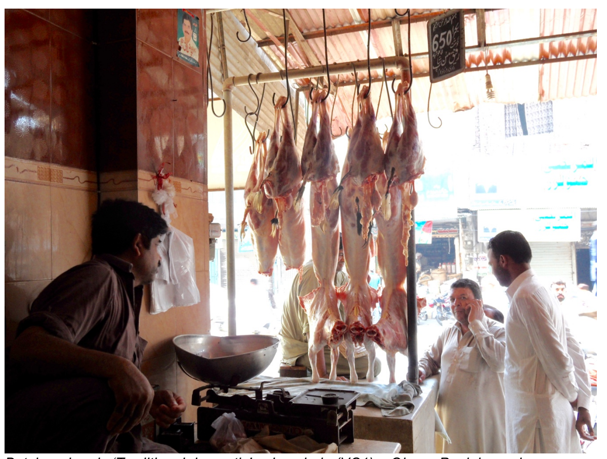
Butcher shop in 'Traditional domestic' value chain (VC1) - Okara, Punjab province

The greatest product flow still appears to be to the domestic value chain (70%).