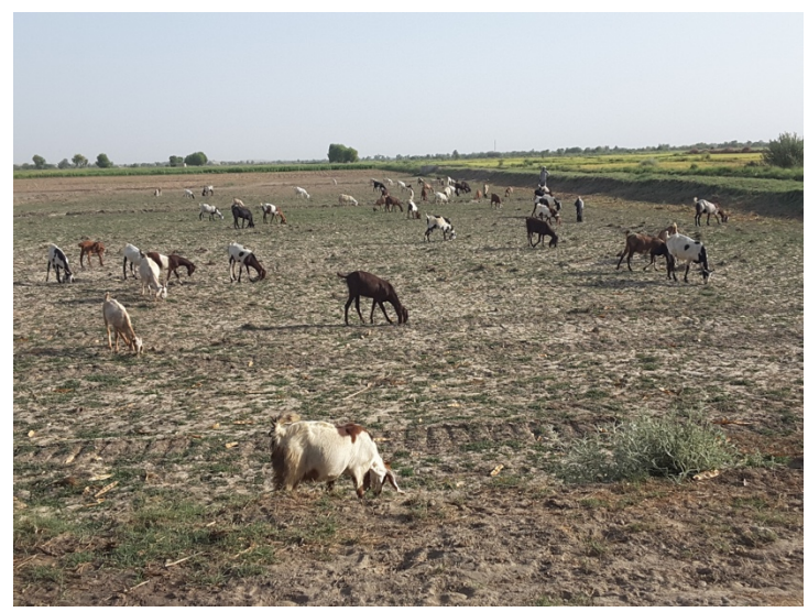
Fig 2: Goats grazing stubble; Goth Kamal Khan, Sukkur (resource rank: moderate)