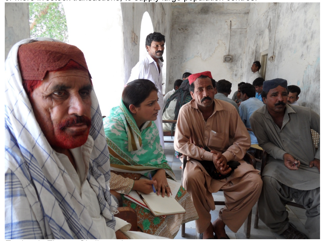
Traders in Thattar, Sindh province

Trading networks appear to operate efficiently over wider geographic areas, with traders and their employees sourcing animals from a variety of areas according to price and availability, and potentially transporting live animals over long distances, and through one or more livestock transactions, to supply large population centres.